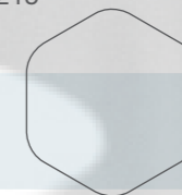
Free Antibleeding Grey