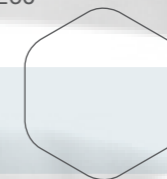
Free 3D Trasparent