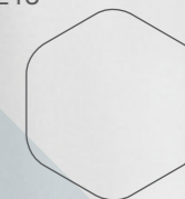
Free Flash White