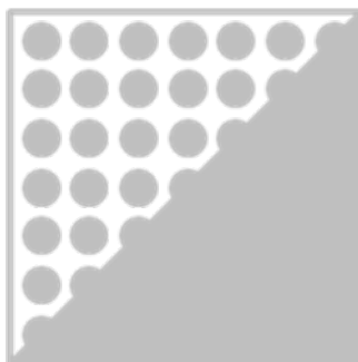
ORAFLEX® 11393 medium